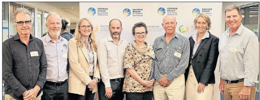
> Leaders from the agricultural industry gathered at the Drought Resilience Showcase and field tour on December 11-12, 2024 in Perth.