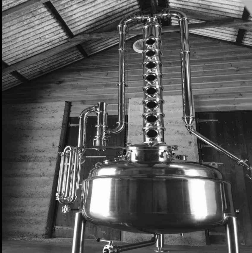
Margaret River Distilling Equipment