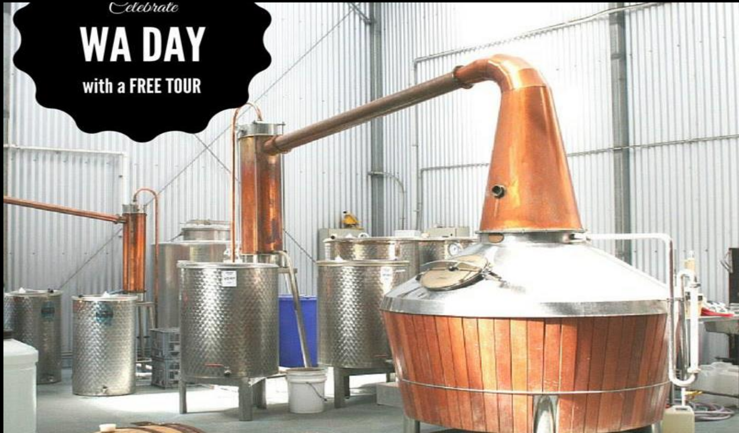
Albany Distilling Equipment