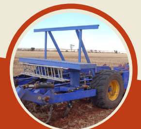
NuFab Hydramax Deep Ripper

Precision sub-soil placement of compost pellets